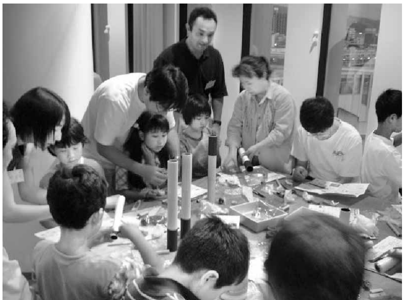
a scene of workshop

In 2008, we analyzed the effectiveness of telescope kit workshops by means of a questionnaire survey covering nine years of experience.